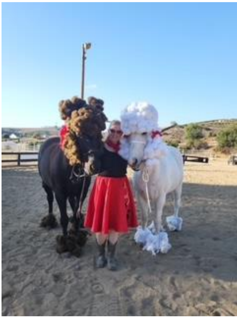
Happy Halloween From HCC campout